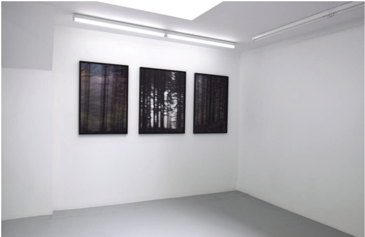
Anouk Ines, From one moment to another , exhibition view at Harlan Levey Projects, 2017