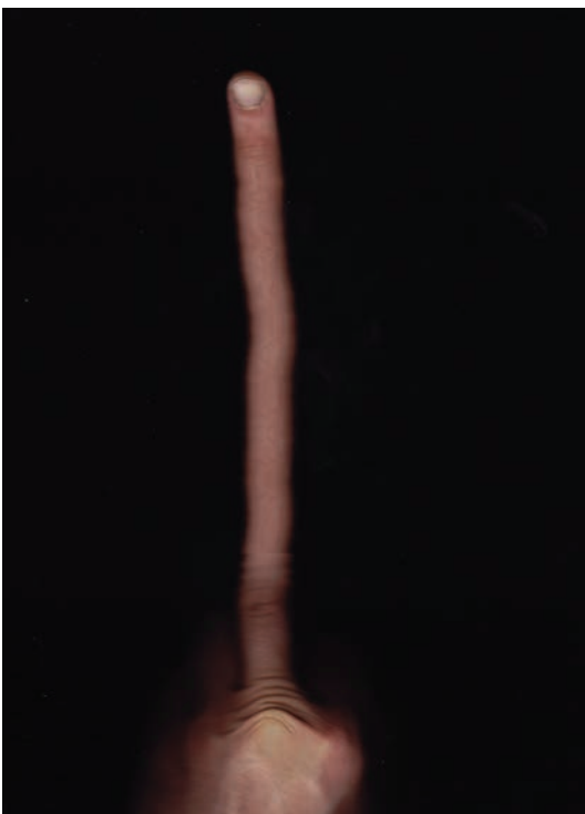
Dead Hands, 2013 Lamda print diasec 88 x 64 cm