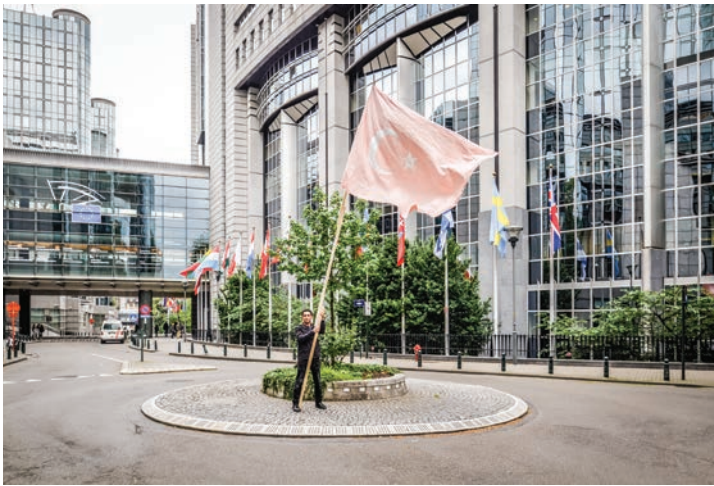
Detox Nation , 2014 Lamda print diasec 74 x 111 cm

If the sun doesn't rise, all the madness stops. The sacrificial blood of martyrs, as meaningless as a flag in the moon. We watch the world melt over a late night kebab. Lift our fingers. Thank our mothers. Learn each other all over again.