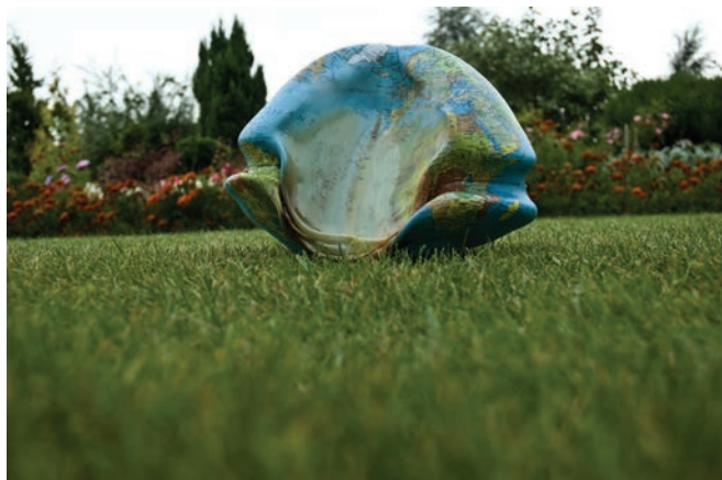
Apocalyptic Kebab, 2012