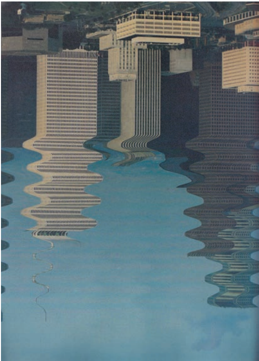
Wonderful Financial World, 2013 Lamda print diasec 88 x 64 cm