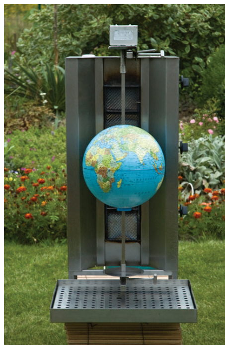
Apocalyptic Kebab, 2012