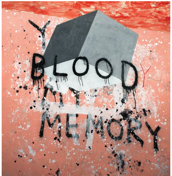
Your Blood, My Memory, 2014 Mixed media painting 155 x 153 cm