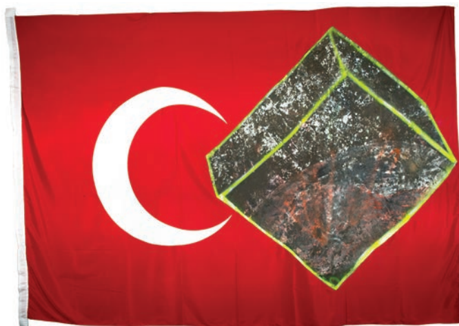
Naturemorte , 2014 Mixed media 200 x 300 cm