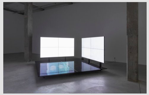
8 LCD screens, black glass, cable, 19 min. HD video, color sound 170 x 310 x 310 cm - 66 7/8 x 122 1/8 x 122 1/8 in