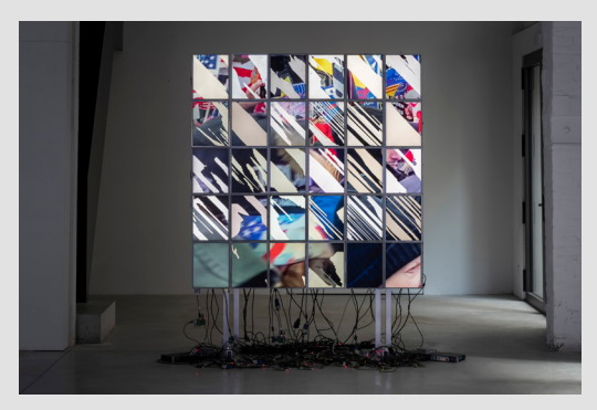
LCD Screens, polarization filter, Raspberry Pi, metal, cables, HD video (22 min loop), 234 \times 179 \times 140 cm - 92 \cdot 1/8 \times 70 \cdot 1/2 \times 55 \cdot 1/8 in