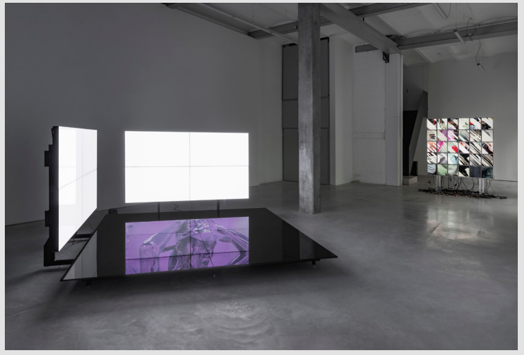
View of the exhibition "A Thousand Pictures of Nothing", Harlan Levey Projects, 2023.