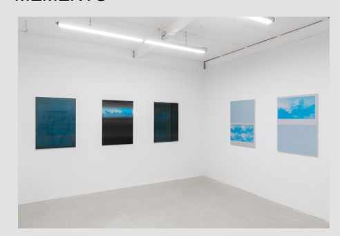
Installation view "A Thousand Pictures of Nothing", Harlan Levey Projects, 2023.