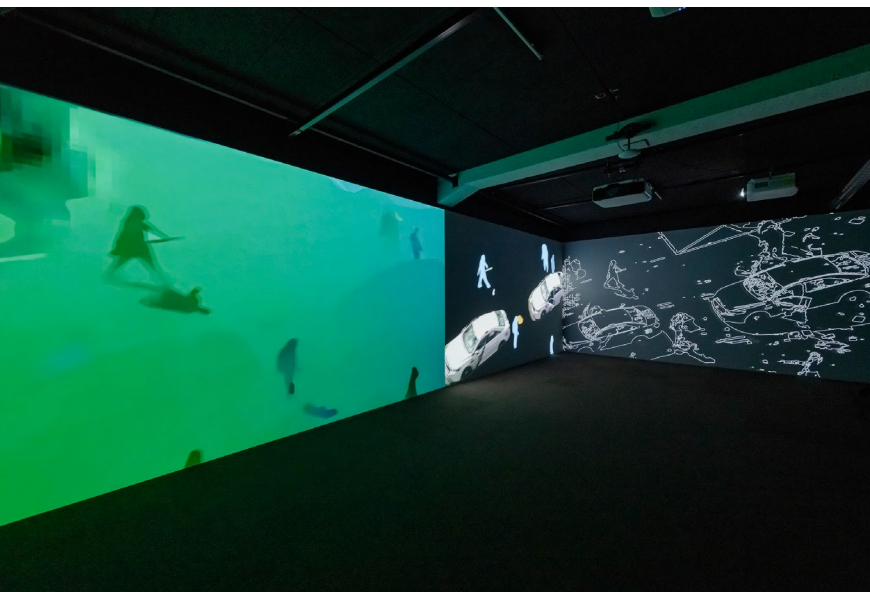
Exhibition view of Seeing is Revealing at HeK, Basel, 2022