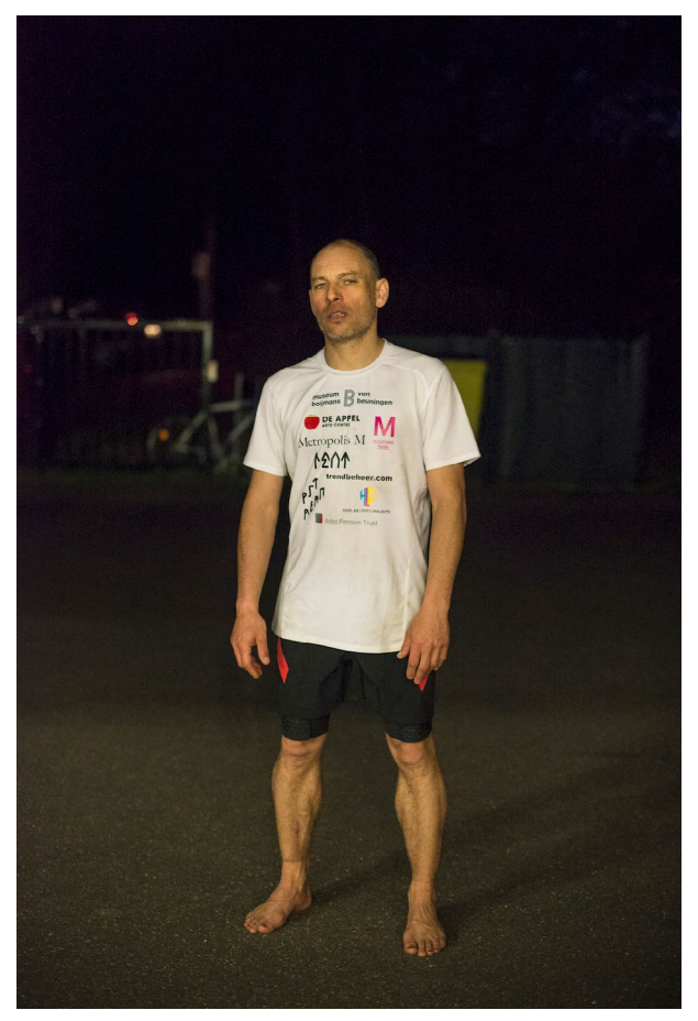
West Coast Washing, 2021 Full HD Video 9 min 10 sec

KM100, 2014 Plexi glass on Lamda print on Dibond, 120 x 80 cm