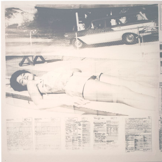
Installation view of Tom and Sue, Harlan Levey Projects 1080, 2022

Bride , 2021 Polymer pigment, silkscreen ink, resin and alcoholic cocktail on Belgian linen 162.6 x 111.8 cm