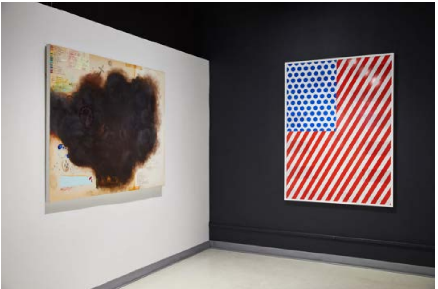
"Sketchbook, With Foreboding" (2019), left, by Renée Stout, and "Heavy Packed with Gas Mask (Amérique)" (2022), by Hank Willis Thomas, at the African American Museum in Philadelphia, in an unusual collaboration with neighboring PAFA.