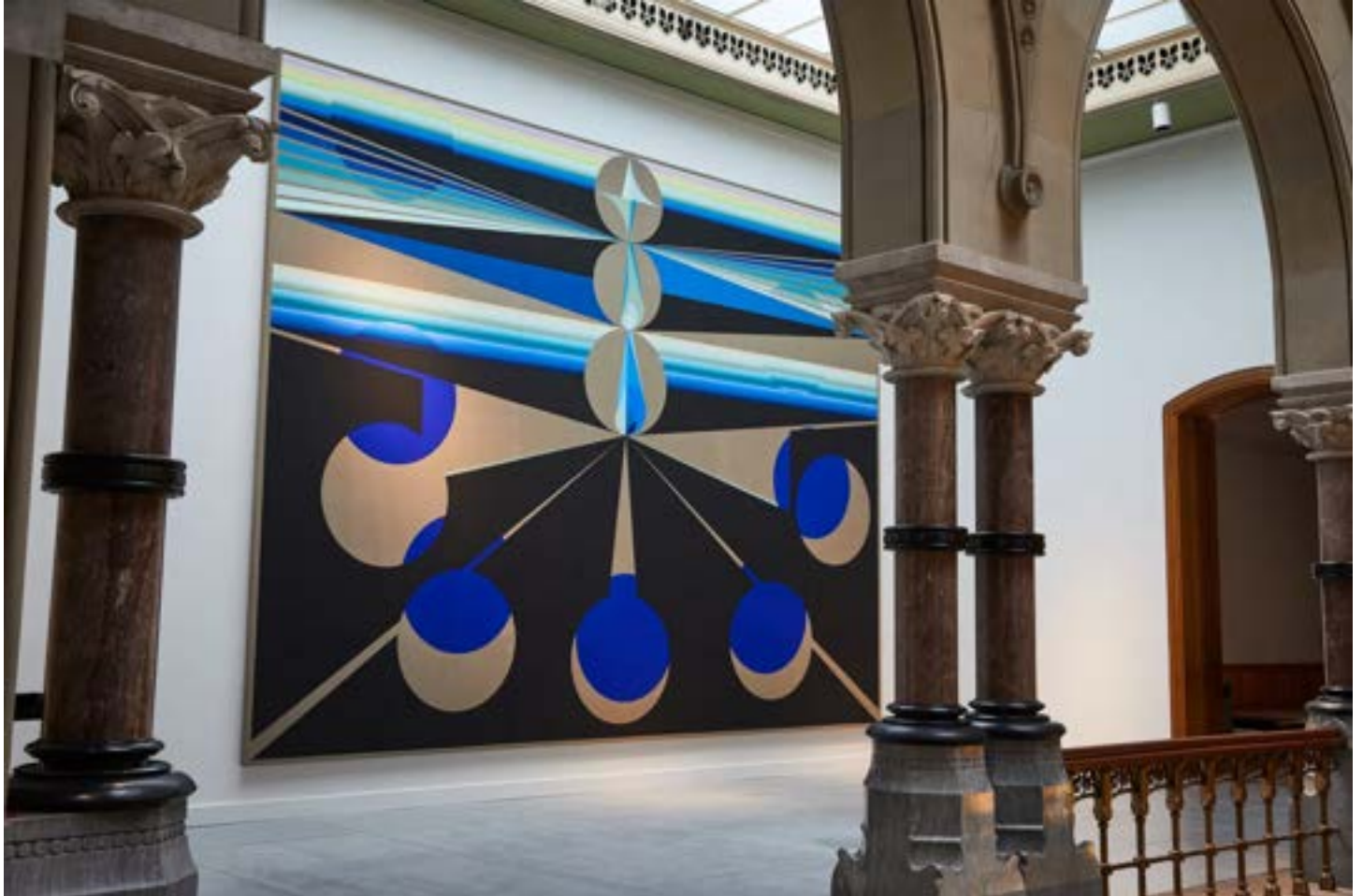
"Black Medallion XIV (Inti)" (2022) by Eamon Ore-Giron at the top of a stair at PAFA.

At the top of the grand stairwell, in place of Benjamin West's two 19th-century biblical paintings, Eamon Ore-Giron has made two monumental abstracted cosmic landscapes, each with black rays emanating from the center and a constellation of stylized orbs. One canvas could suggest dawn, the other dusk.